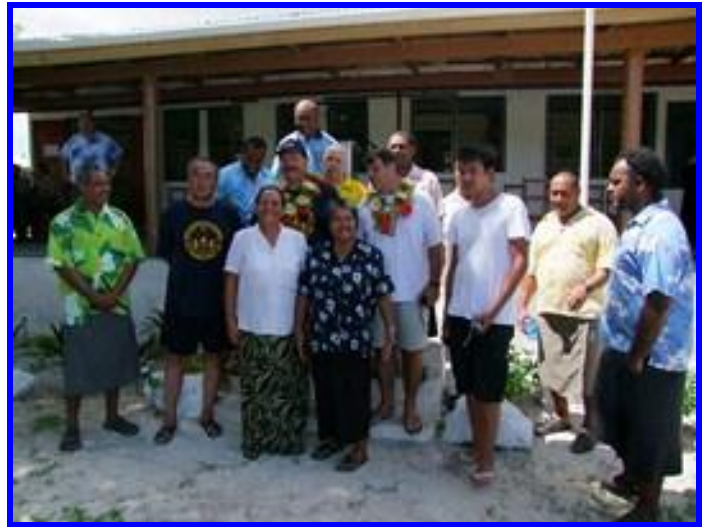
NCDXA making a difference with Youth Development on Rotuma Island – 3D2R – September/October 2011